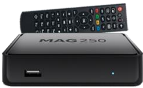
New Remote Control